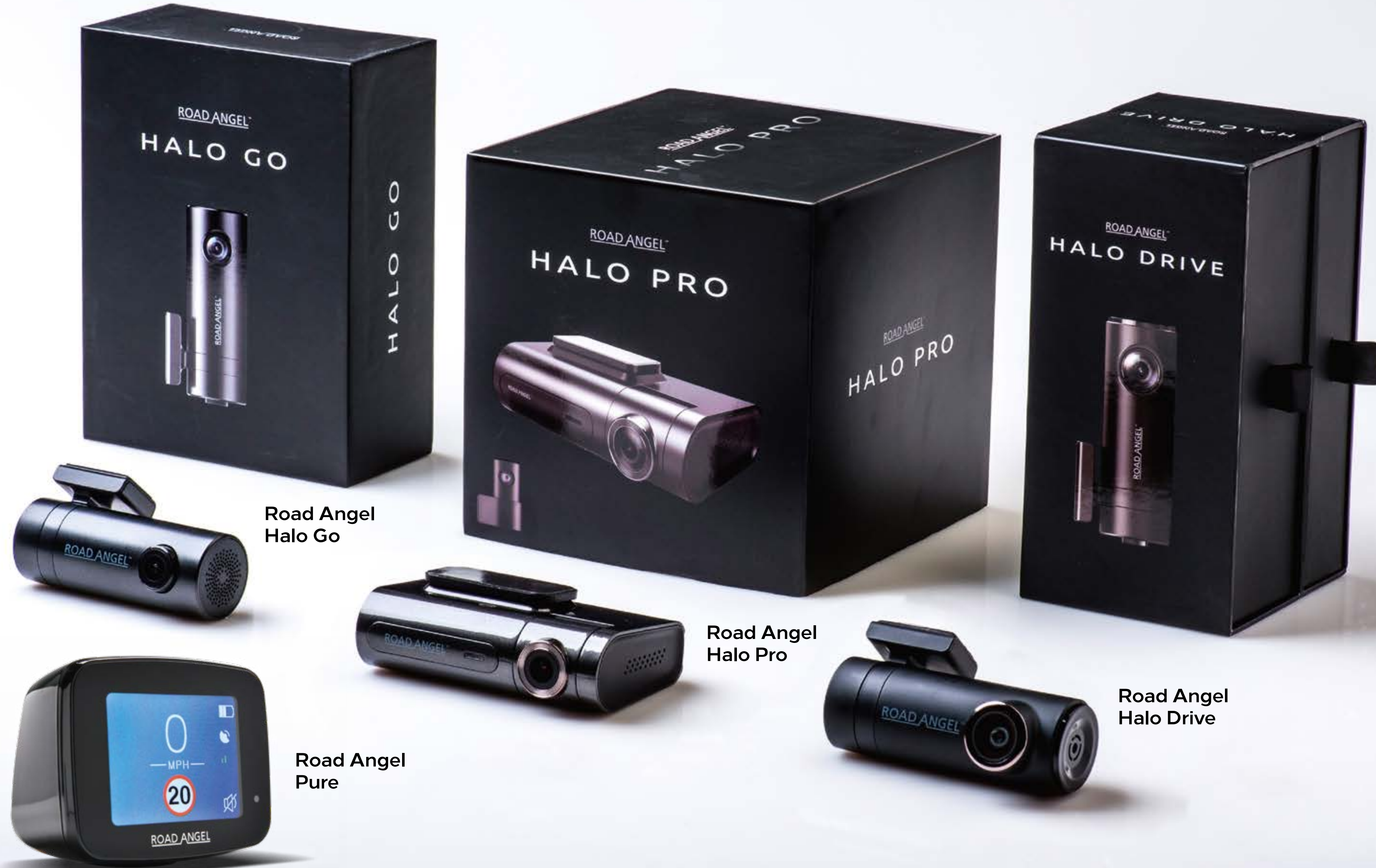
Road Angel Halo Go