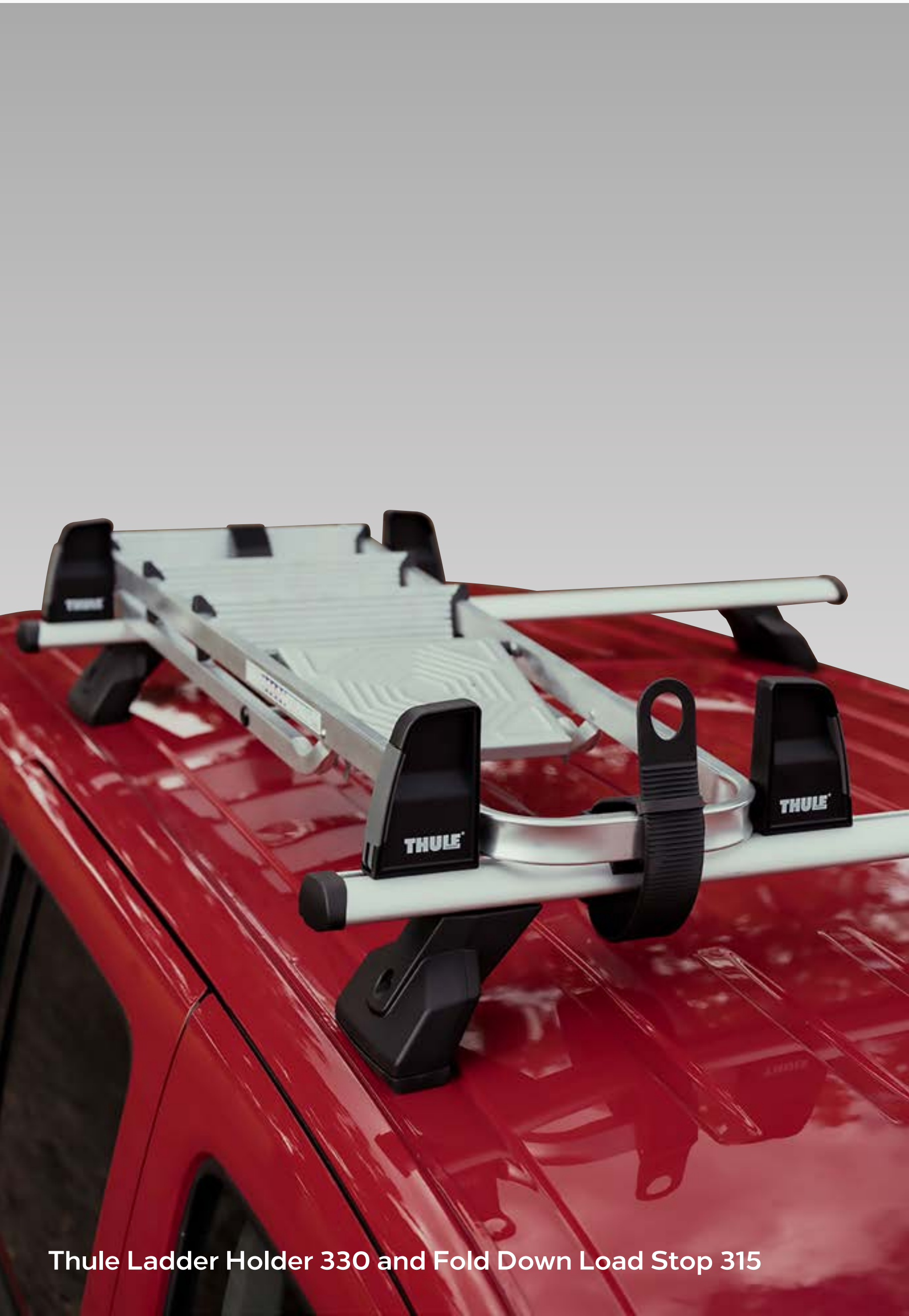
Thule Ladder Holder 330 and Fold Down Load Stop 315