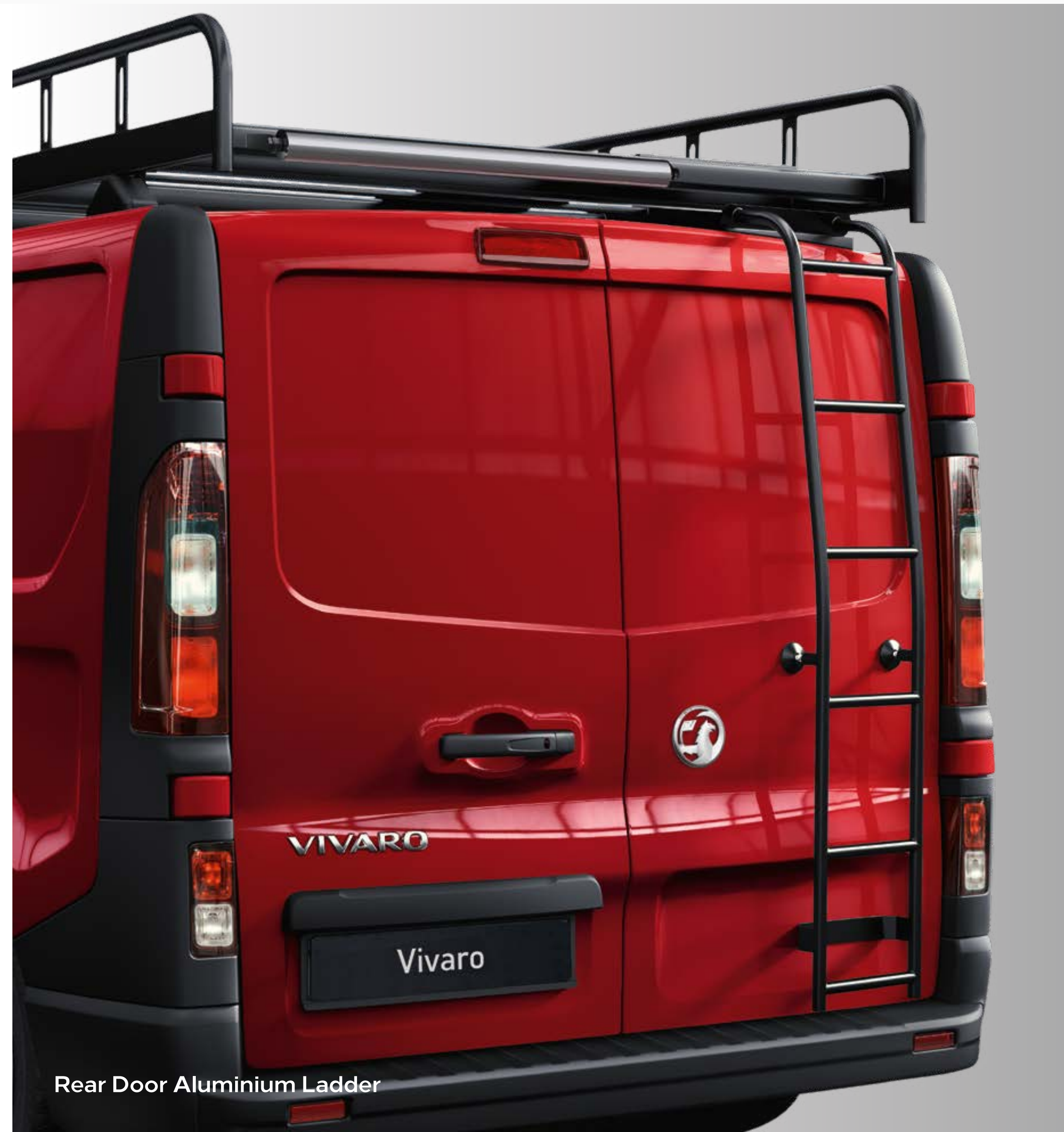
Rear Door Aluminium Ladder