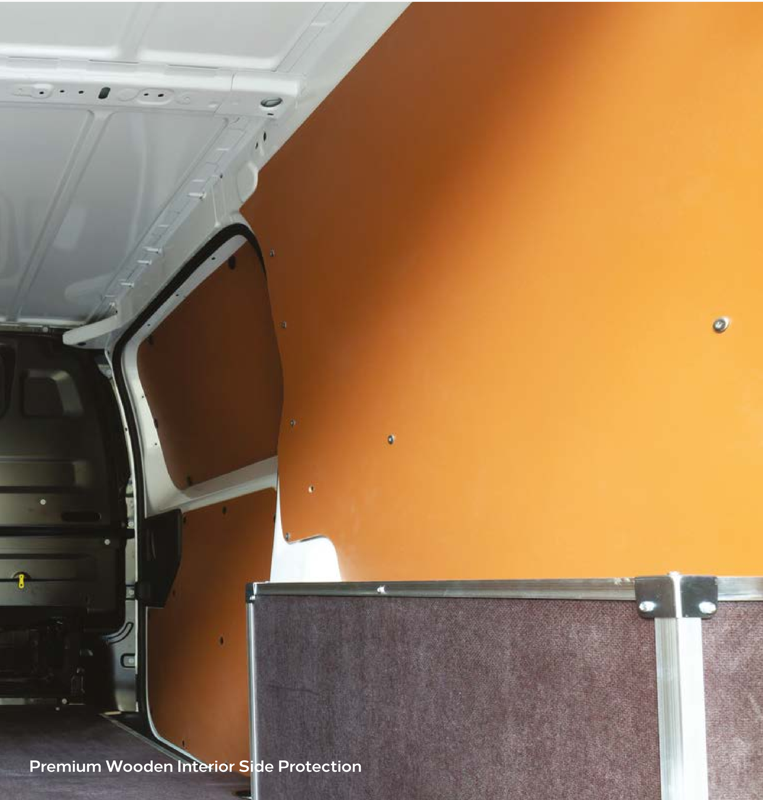
Premium Wooden Interior Side Protection