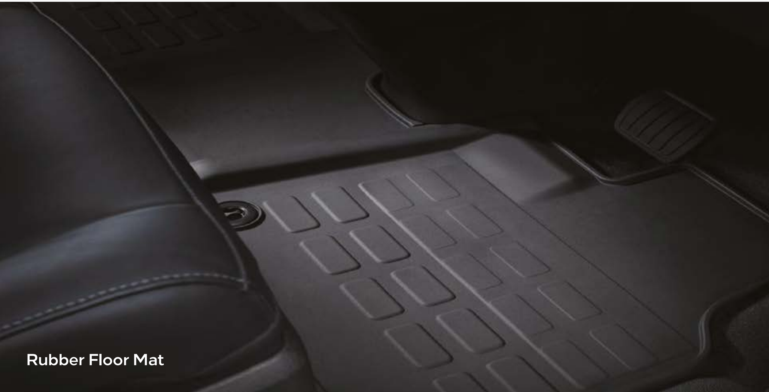
Rubber Floor Mat