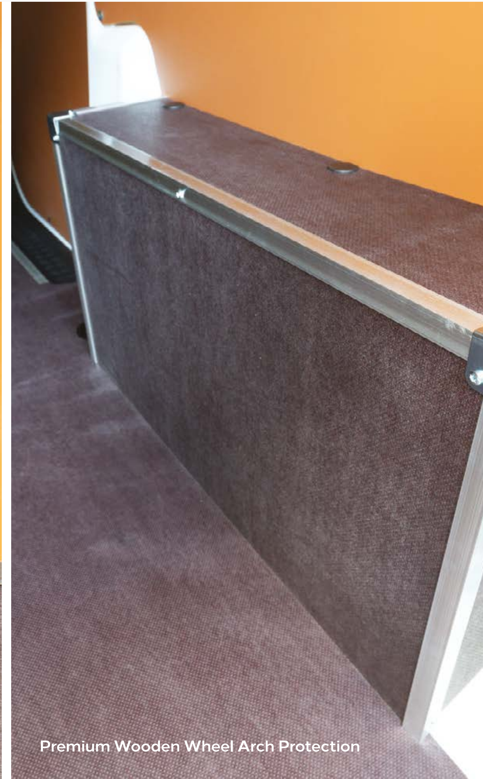
Premium Wooden Wheel Arch Protection