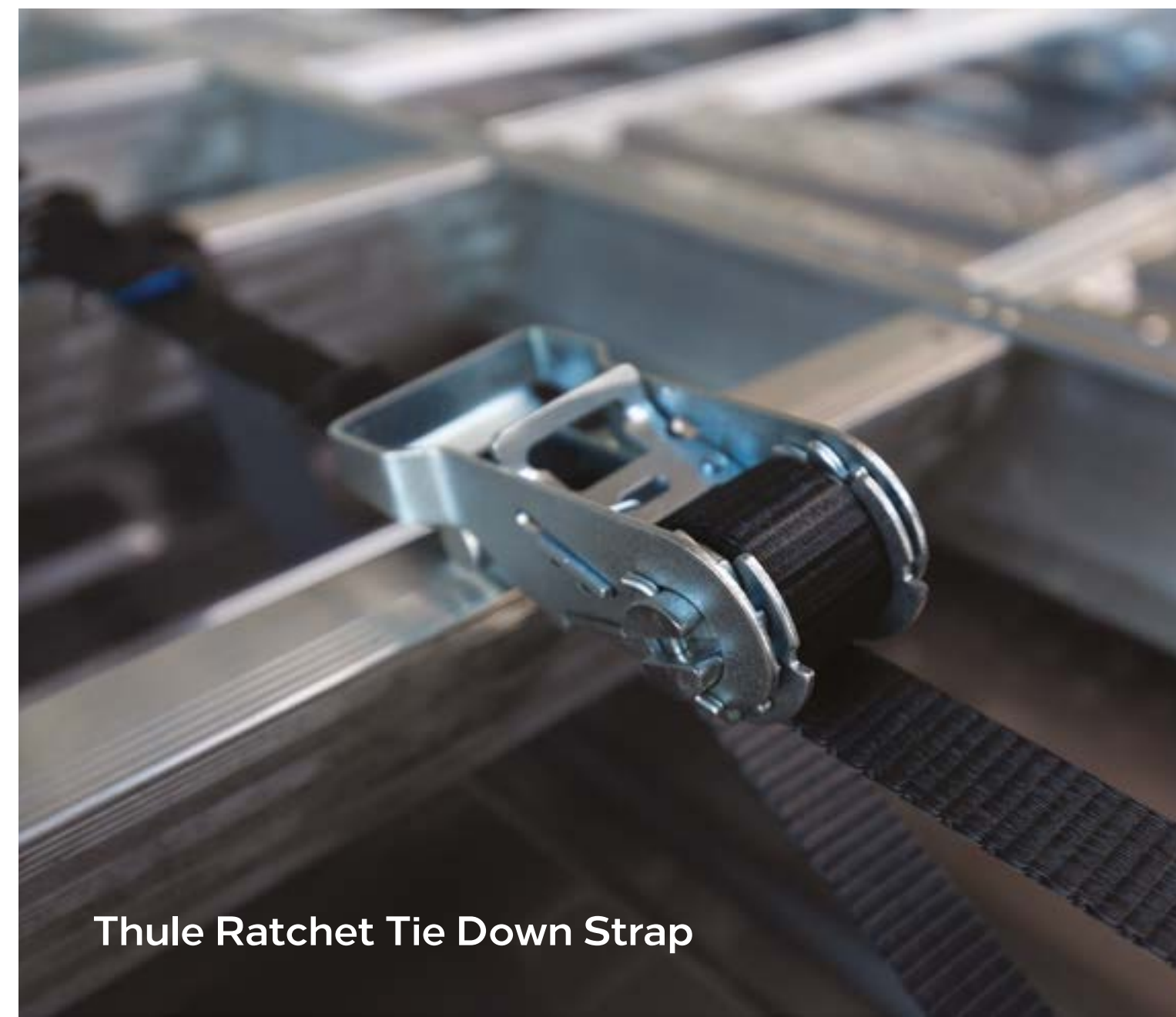
Thule Ratchet Tie Down Strap