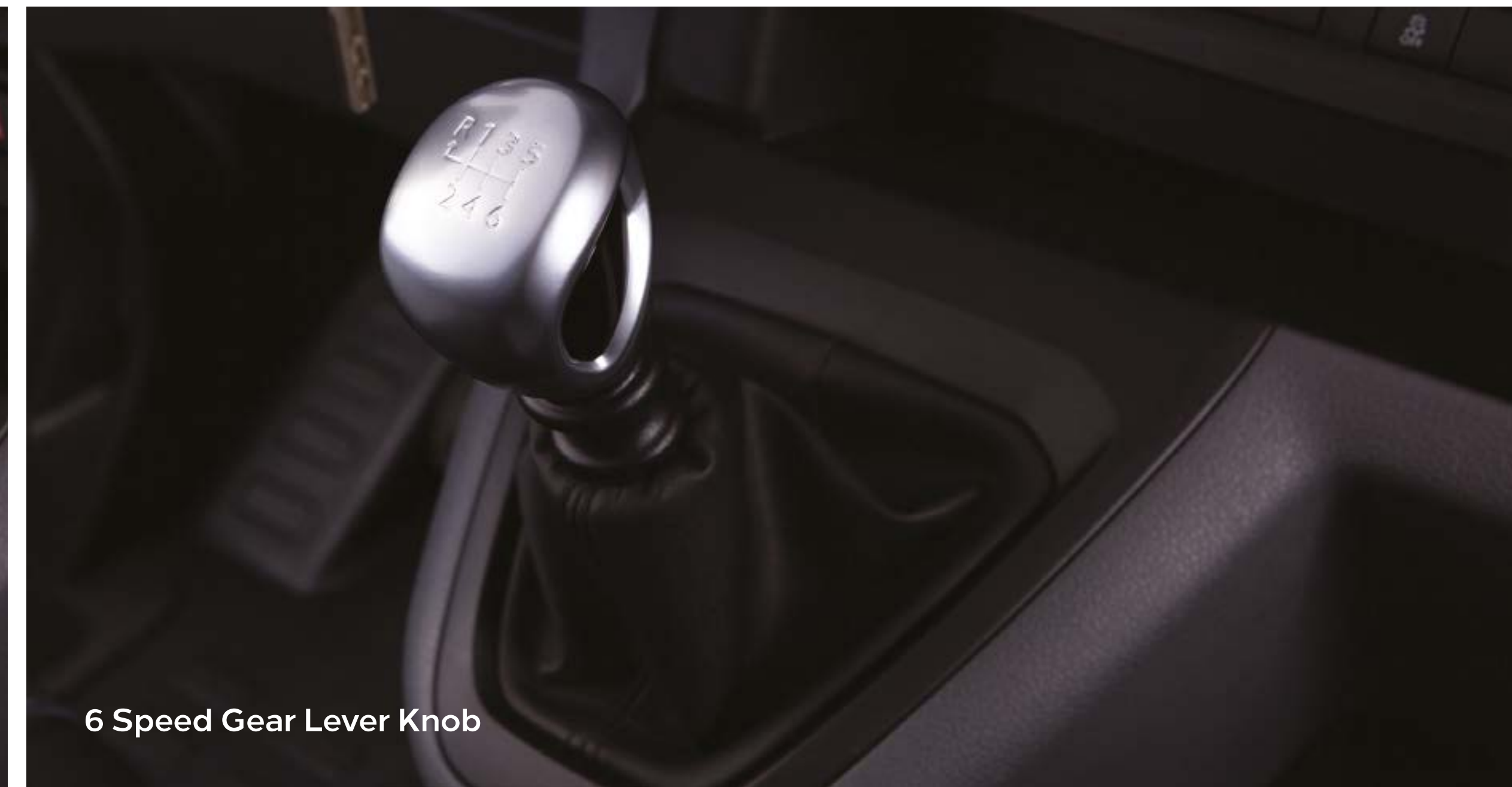
6 Speed Gear Lever Knob