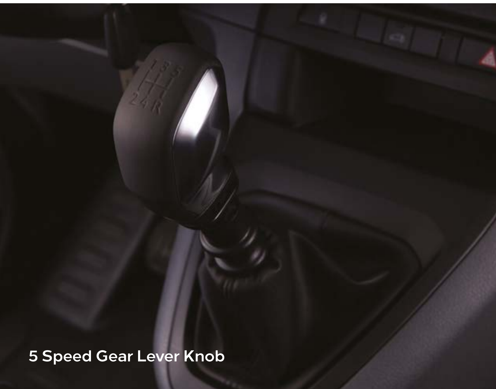
5 Speed Gear Lever Knob