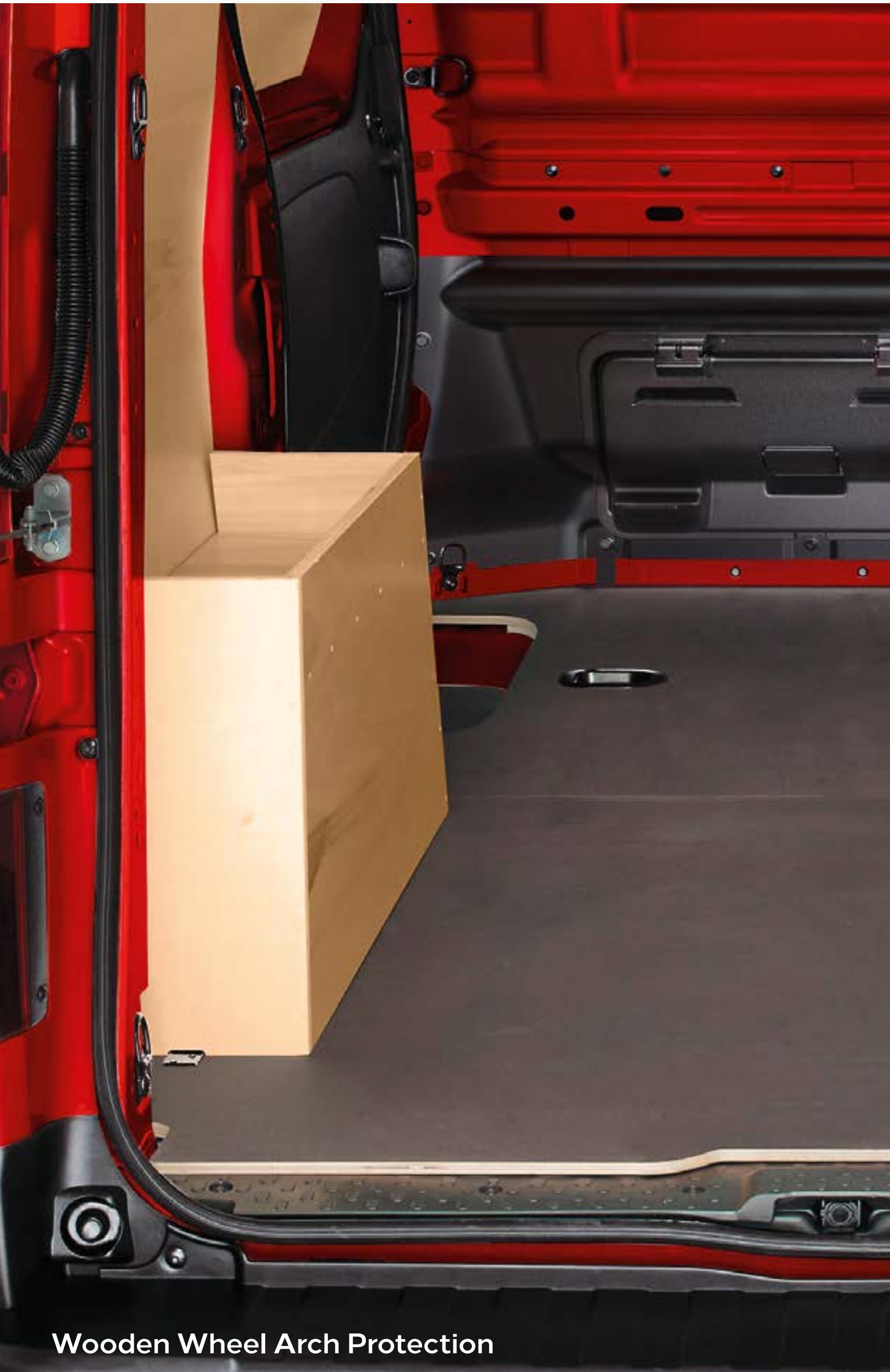
Wooden Wheel Arch Protection