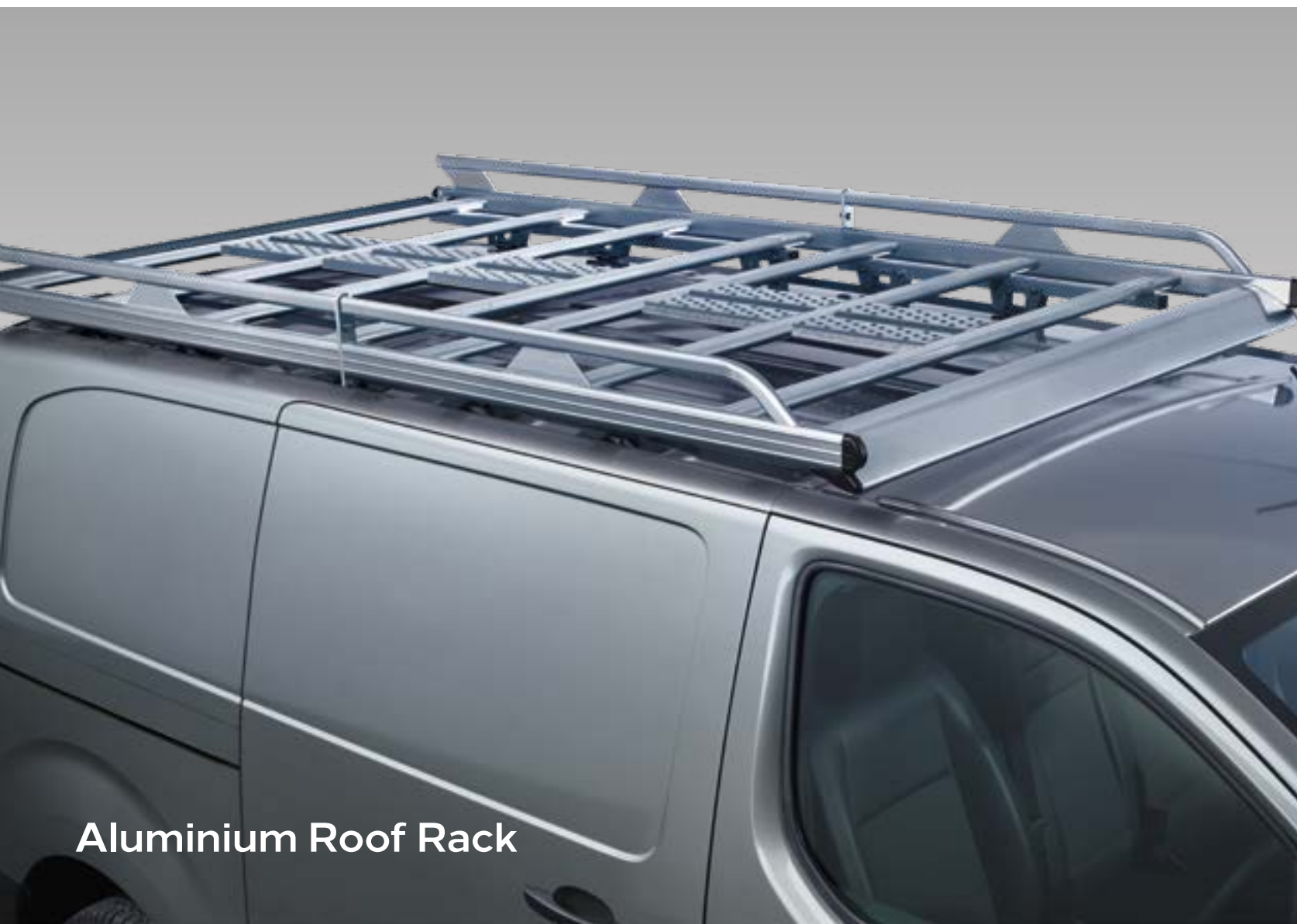
Aluminium Roof Rack