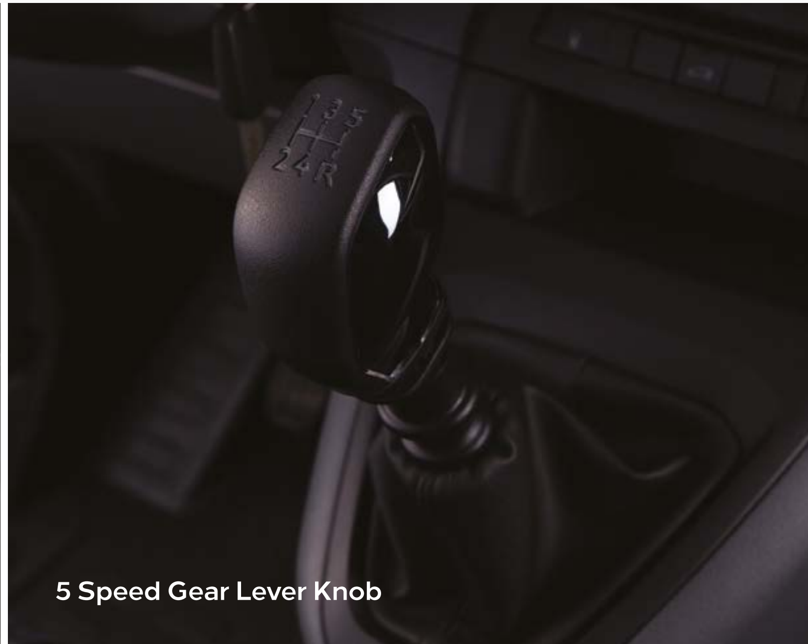
5 Speed Gear Lever Knob