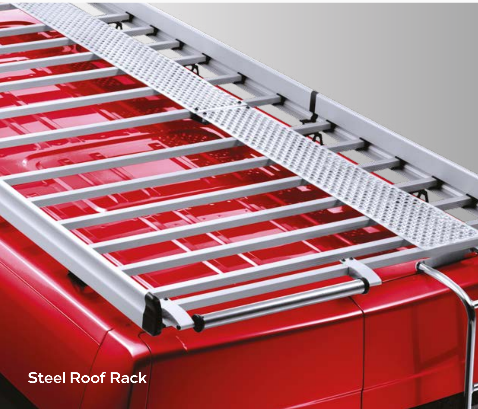
Steel Roof Rack