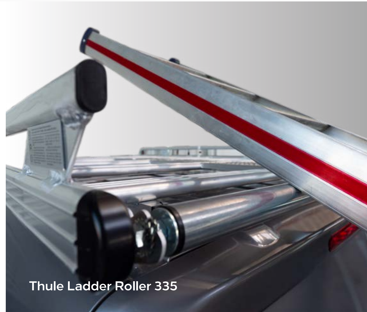
Thule Ladder Roller 335